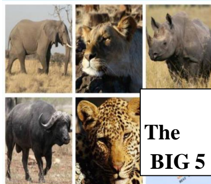
The BIG 5