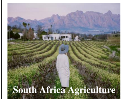
South Africa Agriculture