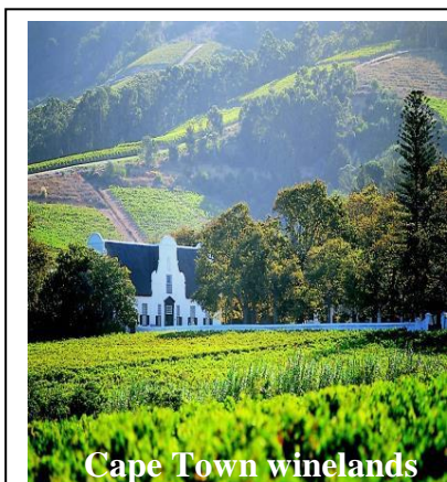
Cape Town winelands

Winter Session: Dec. 28, 2018 – Jan. 12, 2019