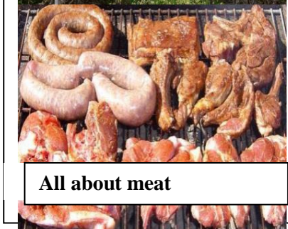
All about meat