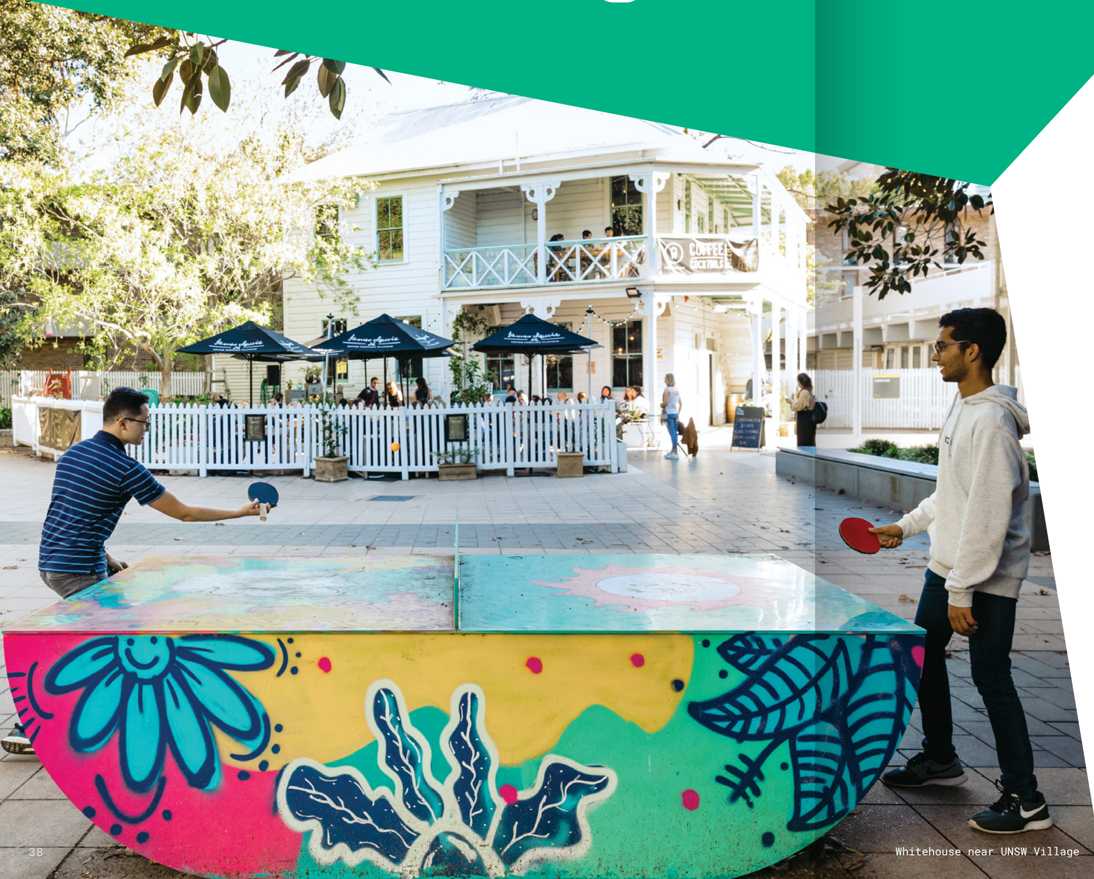
Whitehouse near UNSW Village

The UNSW campus is in the Eastern Suburbs of Sydney and many students choose to live by the beach in Coogee, Clovelly, Maroubra or iconic Bondi Beach. UNSW is a commuter campus, so, the majority of local and international students live off campus. Sydney is a safe, accessible and vibrant city, with public transport connecting the UNSW campuses to nearby beaches and the city centre.