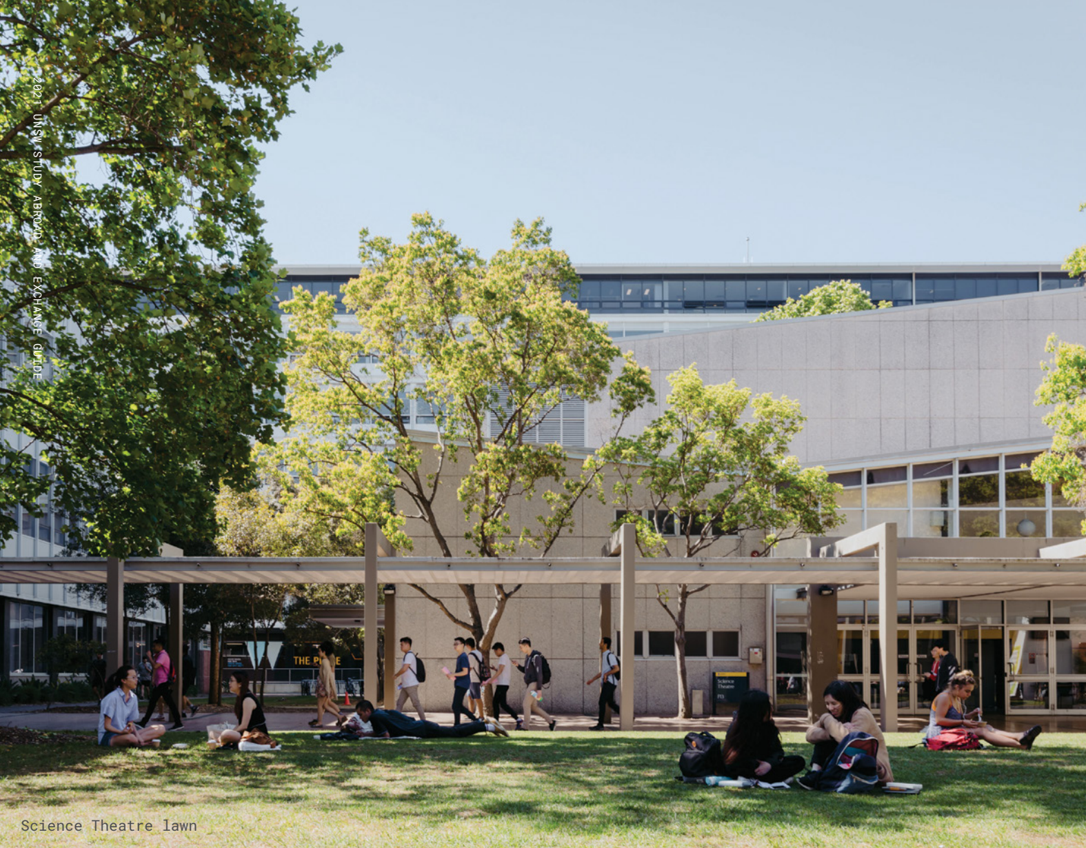
Science Theatre lawn