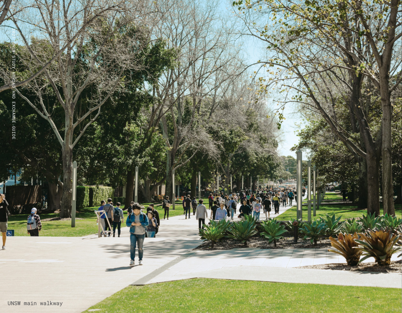
UNSW main walkway