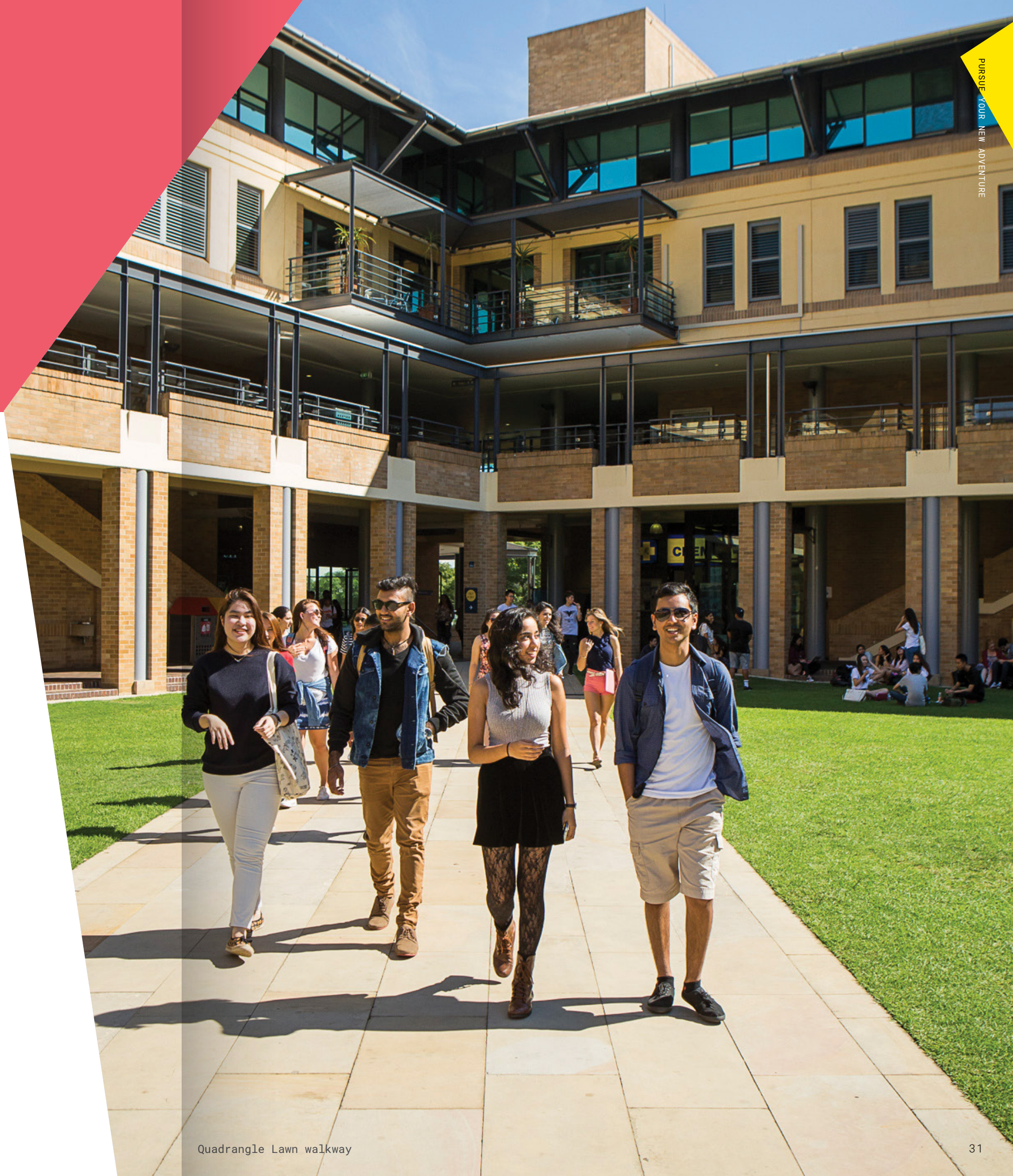
Quadrangle Lawn walkway

Enrolment is subject to course availability and your academic background. It is important to be flexible with your course choice as some fill up quickly or may not be offered in a particular term.