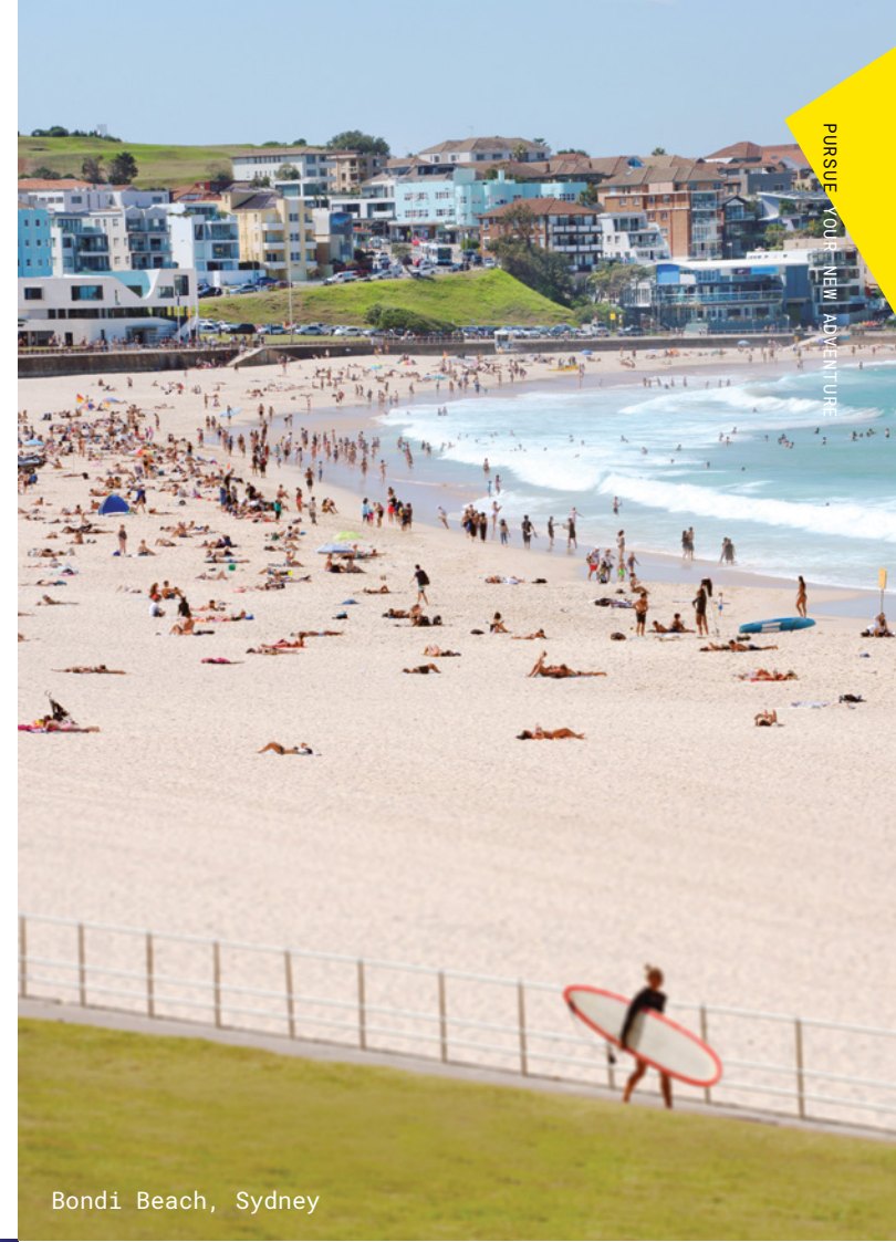
Bondi Beach, Sydney