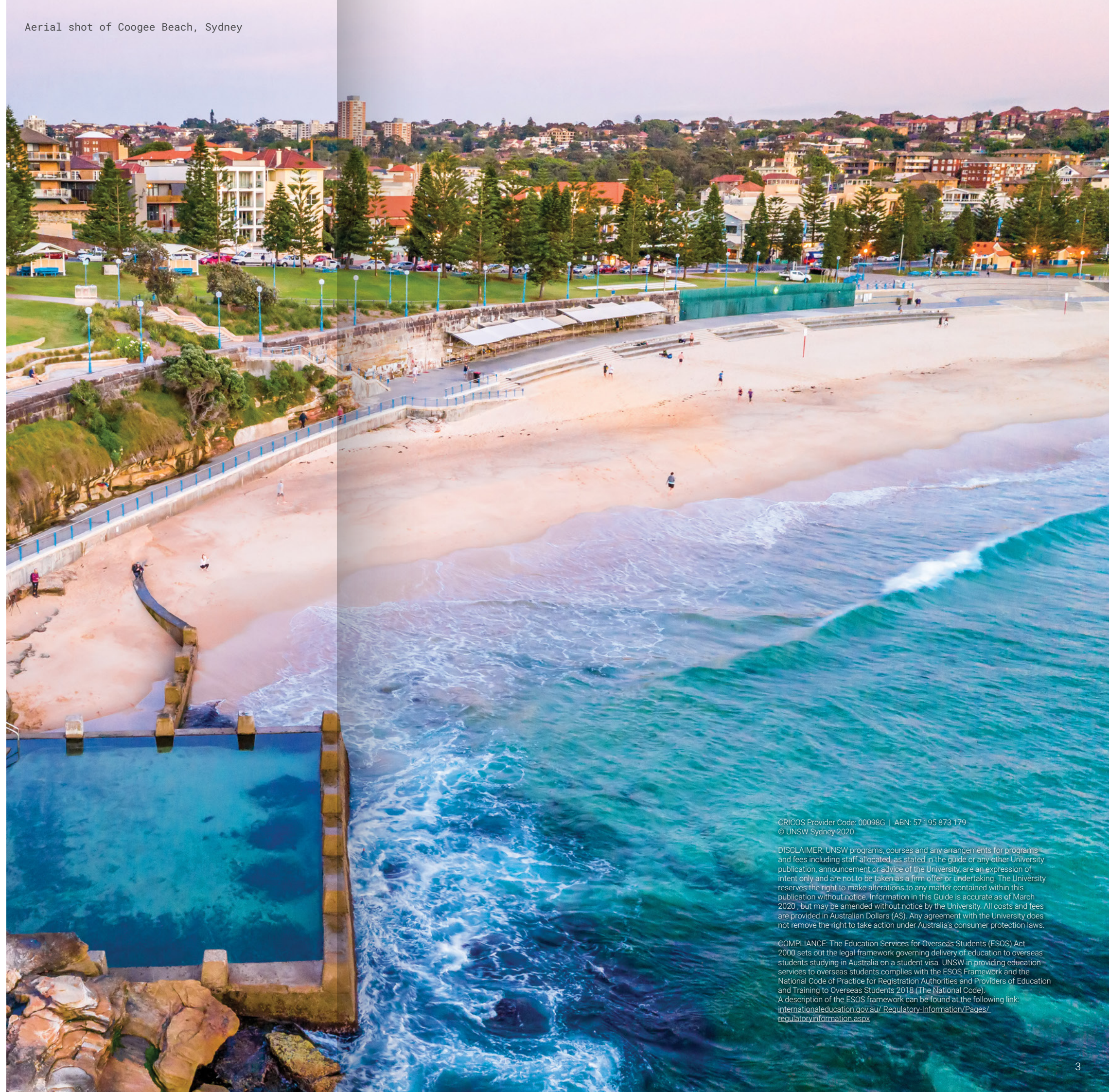
Aerial shot of Coogee Beach, Sydney

CRICOS Provider Code: 00098G | ABN: 57 195 873 179 © UNSW Sydney 2020