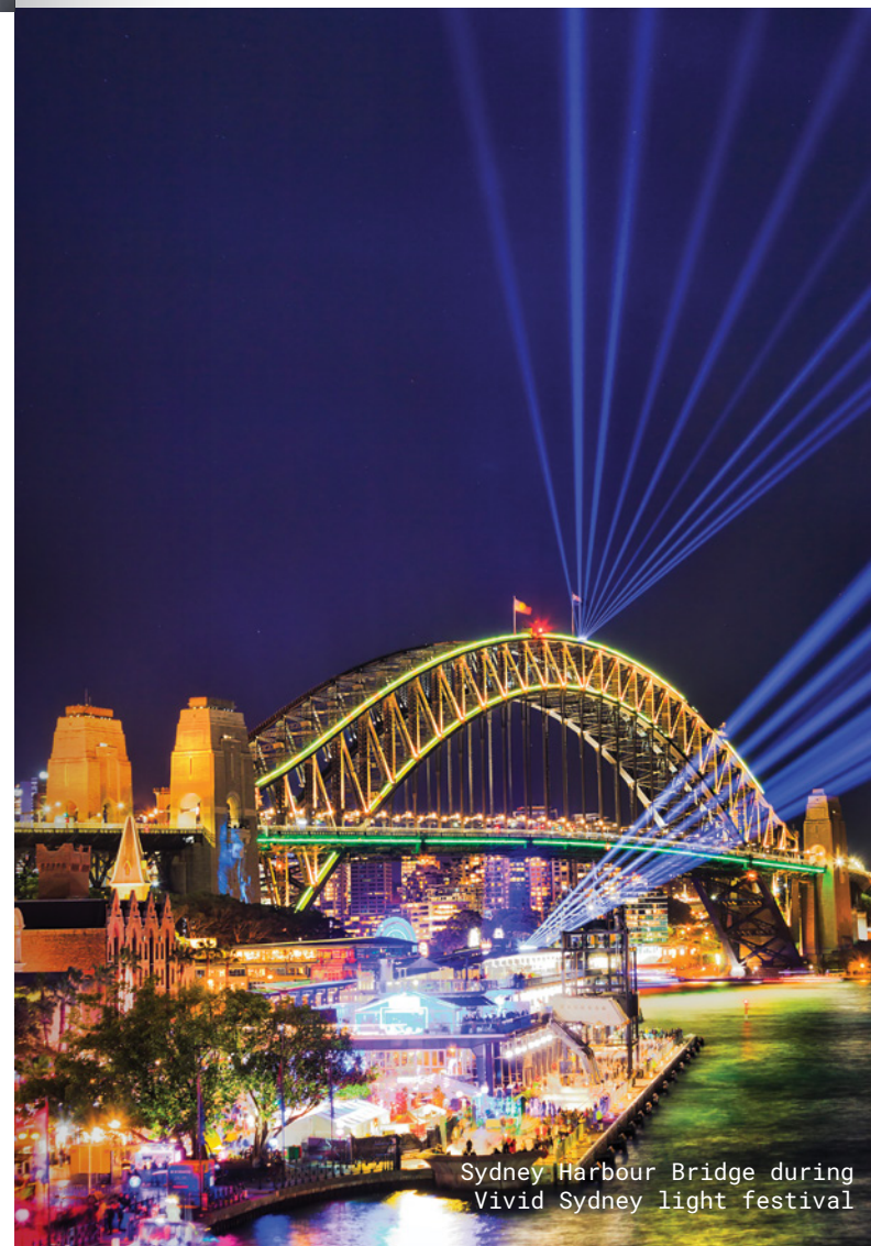
Sydney Harbour Bridge during Vivid Sydney light festival

international.unsw.edu.au/sydney-worlds-best