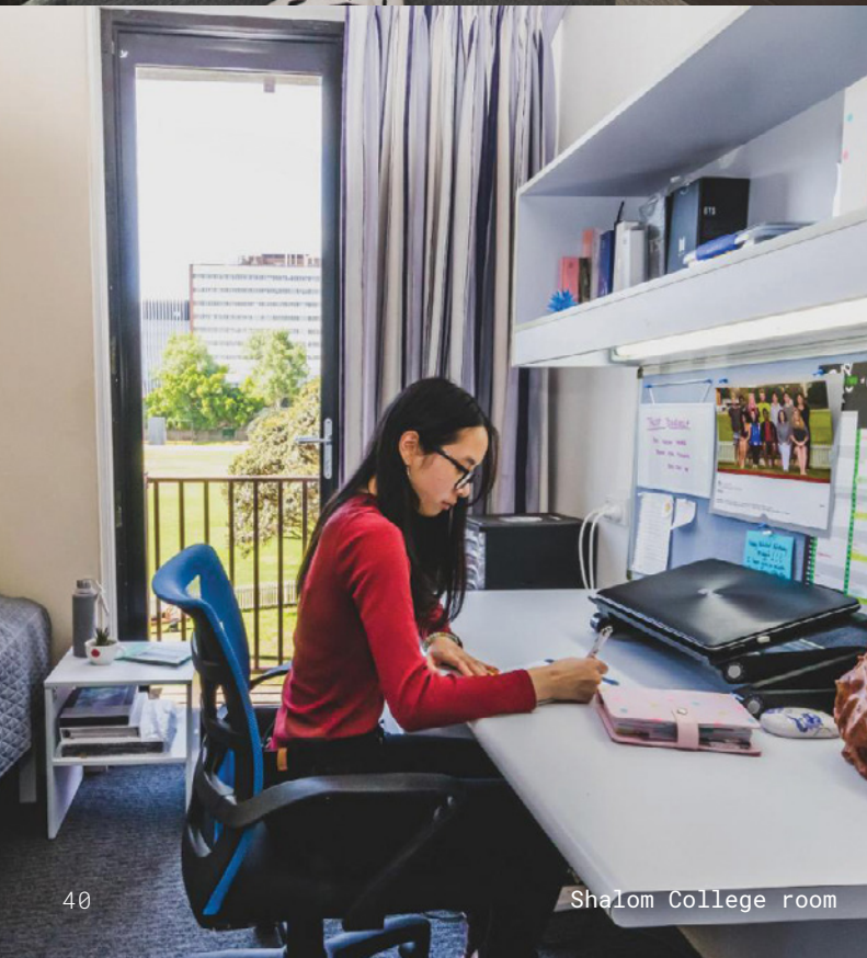
Shalom College room