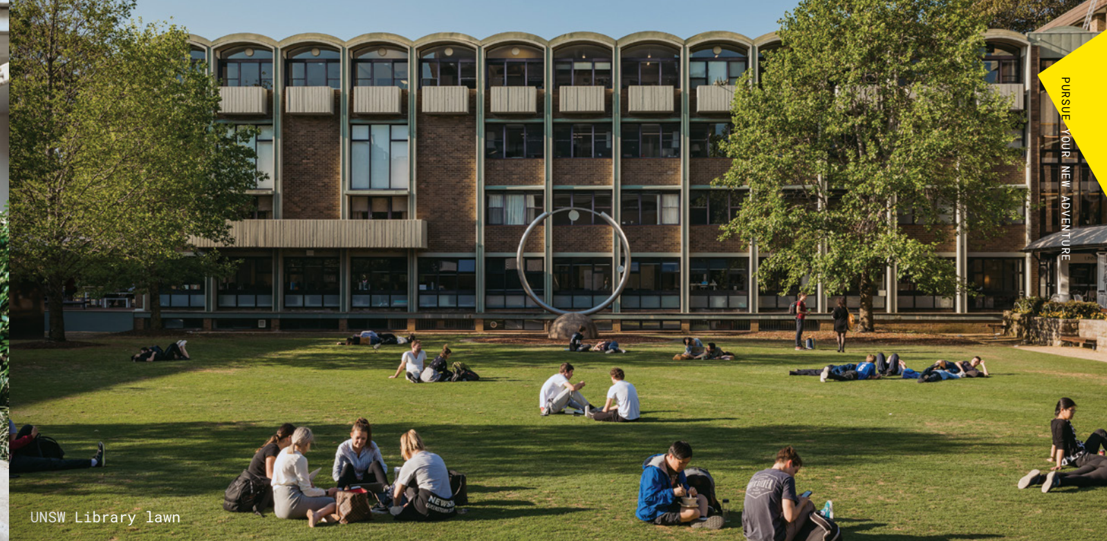
UNSW Library lawn