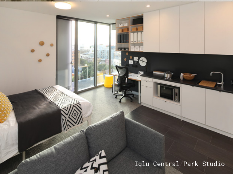
Iglu Central Park Studio