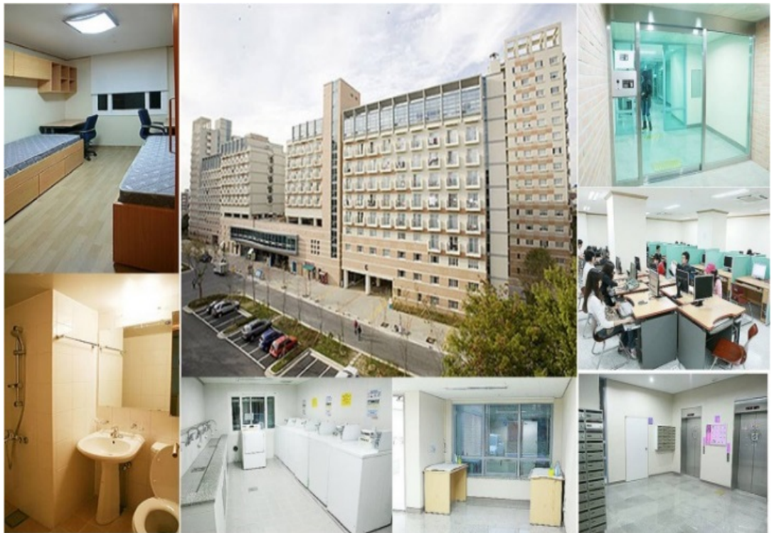
Dormitory Building 9 (BTL)

* The fee mentioned above is subject to change.