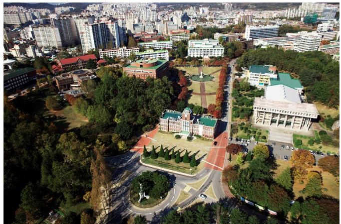
Aerial Shot of the campus